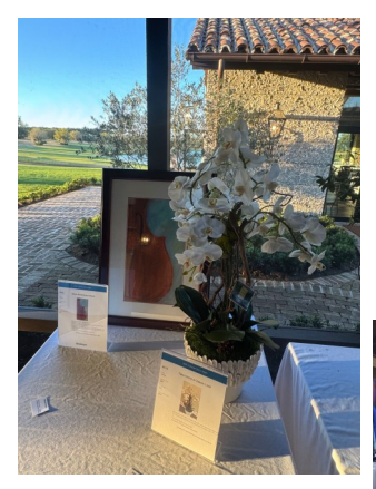
Silent Auction -Beautiful flowers